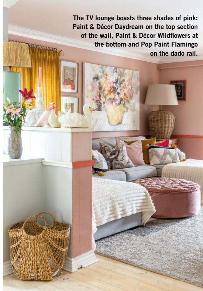
The TV lounge boasts three shades of pink: Paint & Décor Daydream on the top section of the wall, Paint & Décor Wildflowers at the bottom and Pop Paint Flamingo on the dado rail.