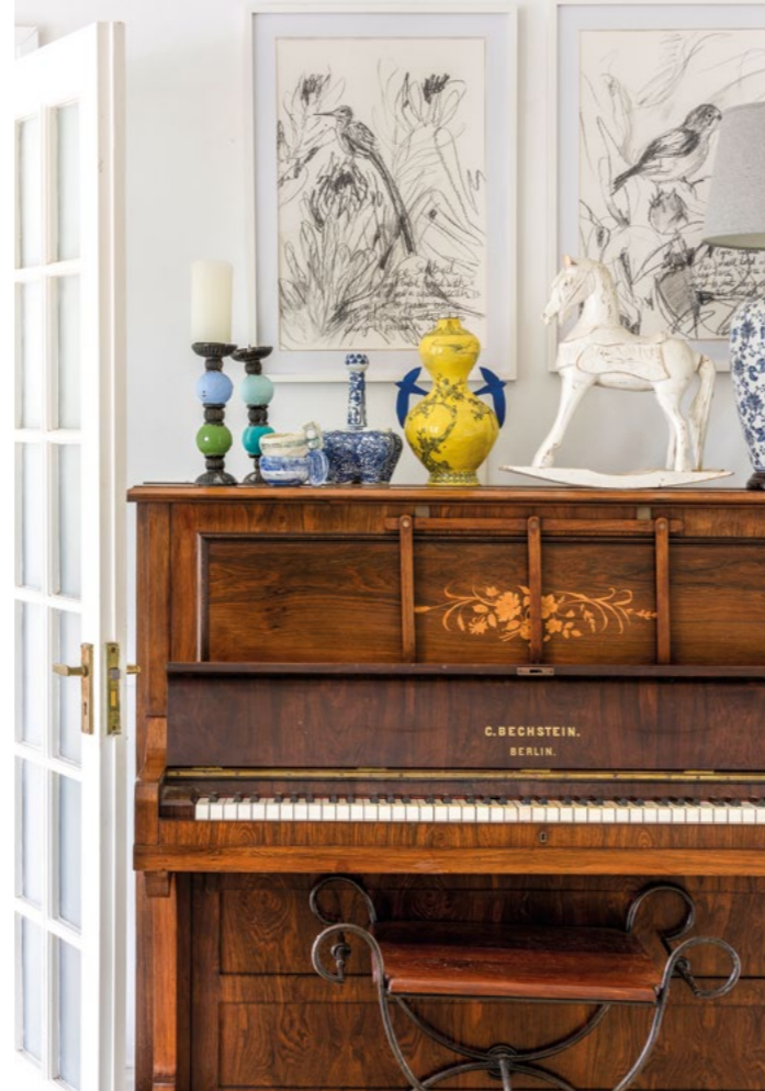
Balancing colours in a room is almost like painting an artwork. I look at a space as a canvas then work with shades and textures to create harmony with a spark of fun for a beautiful, relaxed and welcoming space. – Kim