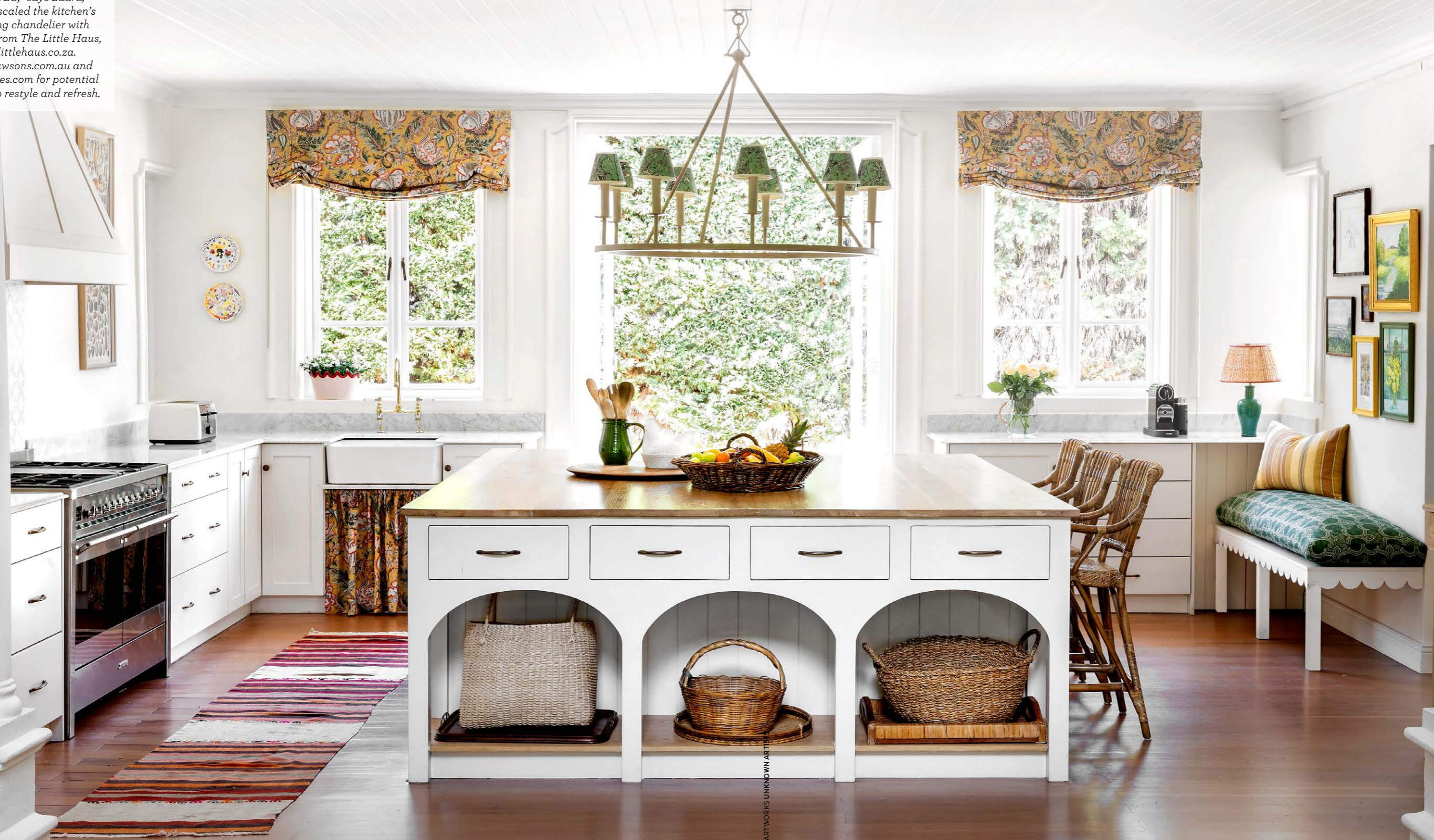
ARTWORKS UNKNOWN ARTS