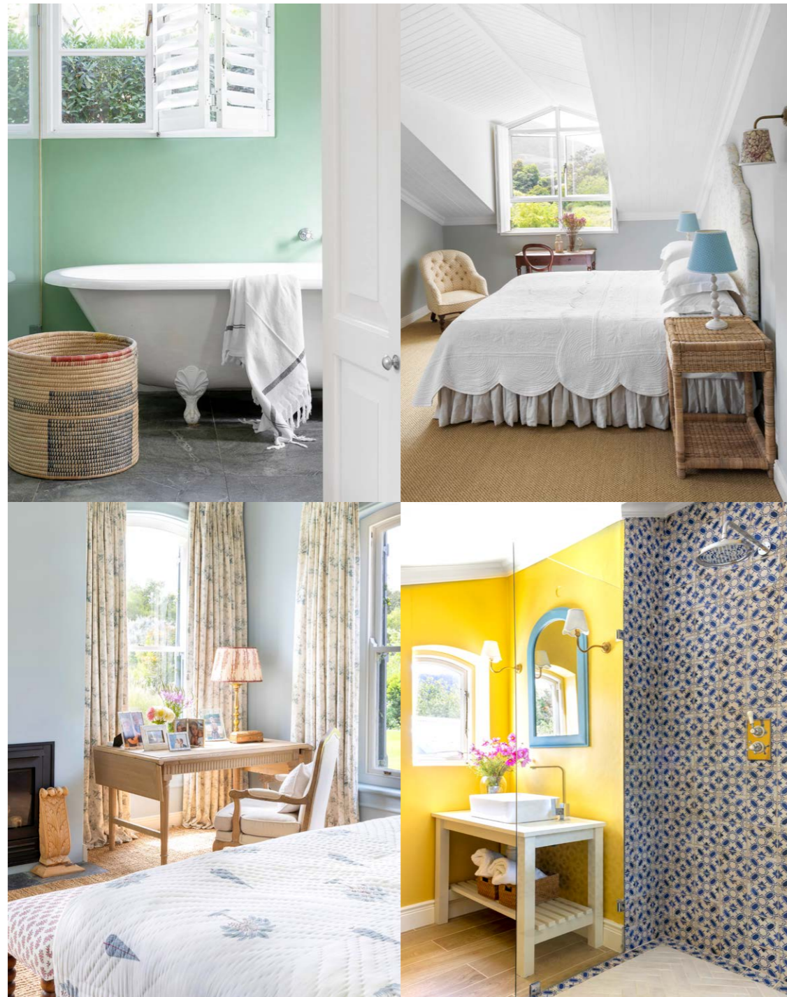
ALFIE'S BATHROOM A lively shade of green paint was chosen for Alfie's bathroom (top left). BEDROOM For many of the bedrooms (top right), Laura chose natural floor coverings for durability and texture. MAIN BEDROOM Laura is planning to replace the existing curtains in the main bedroom (above left) with ones in Penny Morrison 'Vine Flower' fabric. GUEST BATHROOM The tiles chosen for the guest bathroom were inspired by the handpainted tiles found in Portugal. For similar tiles, see the selection at Aeria Country Floors. ALFIE'S BEDROOM "I had such fun playing with pattern and colour in each of my sons' bedrooms. When I found this gorgeous red-and-white gingham, I just knew I had to paint the walls a shade of green," says Laura of Alfie's bedroom (opposite). The print of a Tintin book cover was a housewarming gift from a friend. >