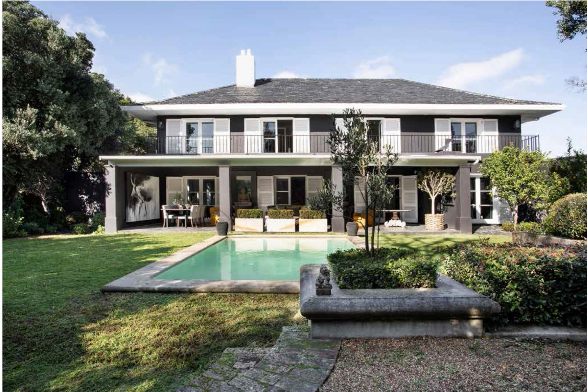
The handsome landscaped garden is centered around an inviting swimming pool.

restoring buildings to their former glory. Naturally, location is always a key criterion, but very often houses first speak to me and I cannot resist the desire to wave my magic wand." Tyers explains, "When viewing a potential new home, I'm always keeping a mental note of where the art will be placed. As soon as your favorite painting is hung on the wall, a space suddenly feels familiar and grounded. It feels like home."