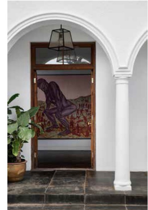
FULLY FURNISHED VERANDA: A mustard colored chair – Nicky's favorite color – provides a bright contrast to an otherwise monochromatic palette. SIDE GARDEN: A life-size crocodile fabricated from recycled metal stands guard. DOORWAY: Through a doorway, a glimpse of a work by noted South African artist Conrad Botes – one of Tyers' favored artists.